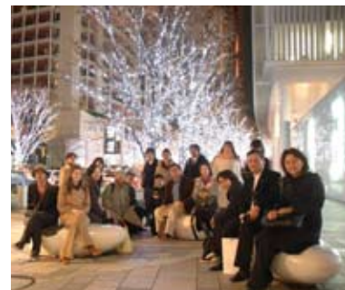
Lighting Detectives on Assignment in Roppongi Hills