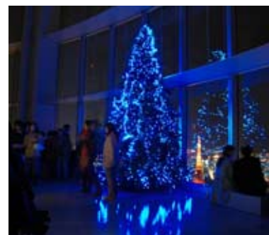
"Sky Illumination" at Mori Tower