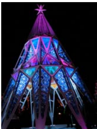
Kiriko Tree at Tokyo Midtown