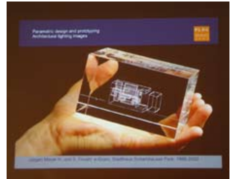
A presentation on lighting visualization techniques

PLDC 2007 was organized by PLDA; Professional Lighting Design Association (formerly known as ELDA; European Lighting Designers Association) and Via-Publishers (publishers of PLD magazine) with the support of sponsors from the lighting industry. Chief sponsors included lighting manufacturers like We-ef, IGuzzini, Fagerhult and Zumtobel. PLDA has been very active in promoting awareness about the profession, and is a voluntary federation of lighting designers and lighting consultants who have a well established international presence. These members through the various activities of PLDA try to establish a sound reputation for the profession right from education to industry and professional practice issues. Principal activities include conducting international workshops on lighting design, conventions and seminars and support for lighting education in the institutions that are taking up lighting design as part of their curriculum. PLDA conducts a lighting workshop annually in Alingsas (Sweden) with the assistance of the city council.