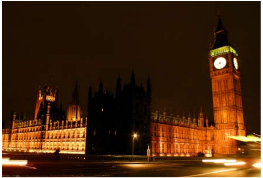
From the bridge, a panoramic view of the building

that showcases some of the pioneering lighting designer's best works over the years. Richard Kelly practiced in the 50s and I was amazed to see that most of works were so revolutionary in those days. He was the pioneer who coined the words 'ambient lighting', 'focal glow' and 'brilliance' which have become standards for all lighting designers today. The exhibition consists of 37 framed works and photo-panels which display original drawings, prints and photographs from the Richard Kelly archive. The works were displayed highlighted the philosophy of the famous American architect and lighting designer, especially his exemplary approach to building illumination, day lighting and fixture design.