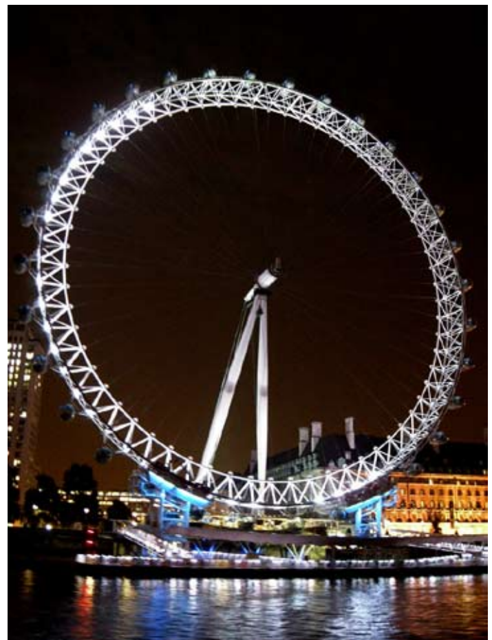
The London eye – as seen from the river cruise on the Thames