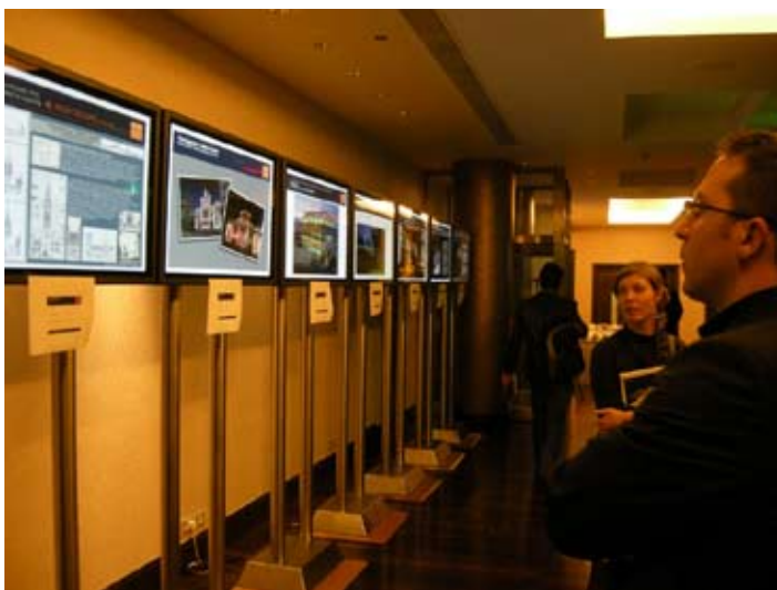
Self-running powerpoint presentations by some of the attendees