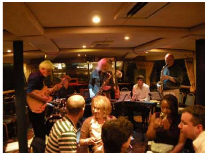
Live Band playing in the cruise party for the guests!

At the close of the 3 day convention, a declaration prepared by PLDA was made on the status and future of the lighting design profession. This declaration highlighted the need to recognize lighting design as an established profession by individual governments and all international bodies dealing with the recognition of professions and independent disciplines.