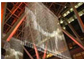
Crystal-like Aurora Borealis