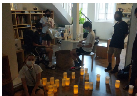
Students crafting in the office