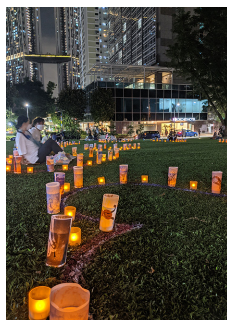
Lanterns with drawings from the students