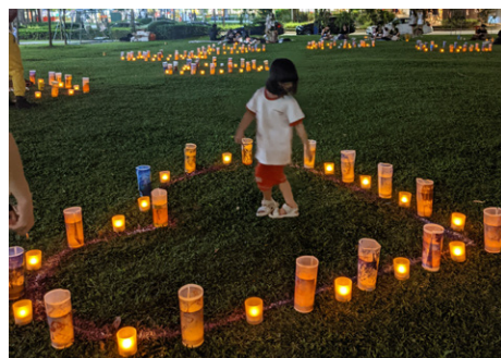
Kids playing around the lanterns