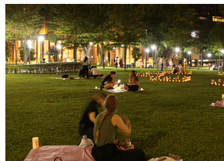
People enjoying the picnic