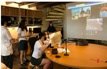
Office meeting with venue sponsors