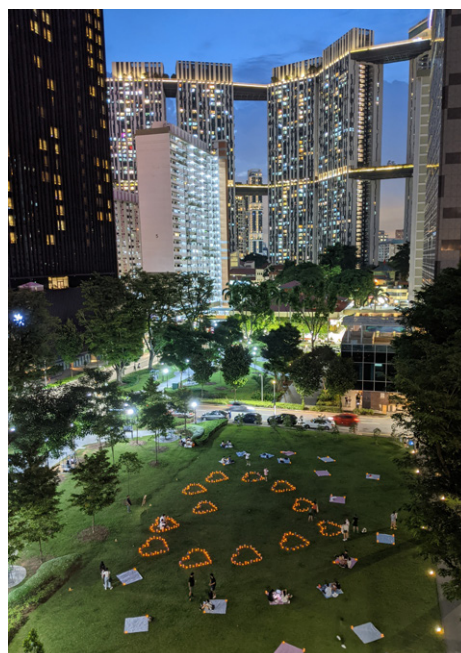
Aerial view of the installation layout